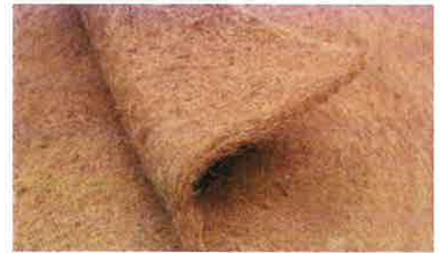
TERRAGREEN® PRODUCT CODE TAI-205

TerraGreen® is a composite blanket material made essentially from natural coco fiber with one geosynthetic layer on one side or both sides of the mattress. Very often it is recognized as non-woven natural geotextile. It is a custom designed erosion control mat / blanket useful for protecting dry and intermittently wet and erodible slopes. TerraGreen® is an eco-friendly solution for erosion protection by prompting vegetation growth in a faster way. TerraGreen® as a stand-alone technique or in combination with other solutions like TerraNail® or TerraAnchor™ is often used to mitigate low to medium grade surface erosions resulting eventual soil slips and slides.